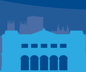
York Art Gallery