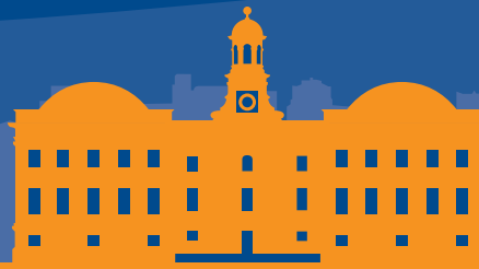
York Castle Museum